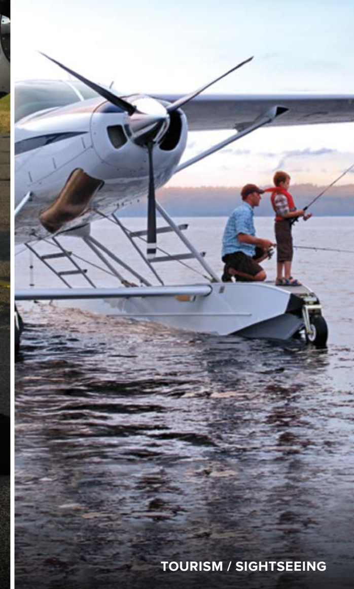
TOURISM / SIGHTSEEING