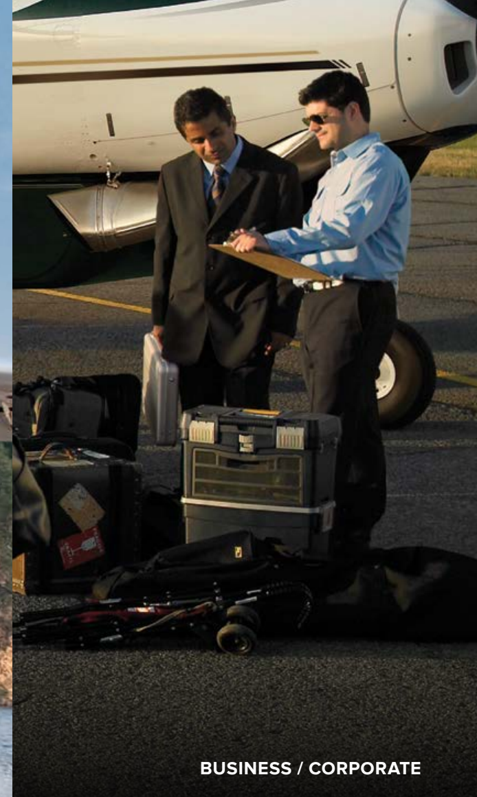
BUSINESS / CORPORATE