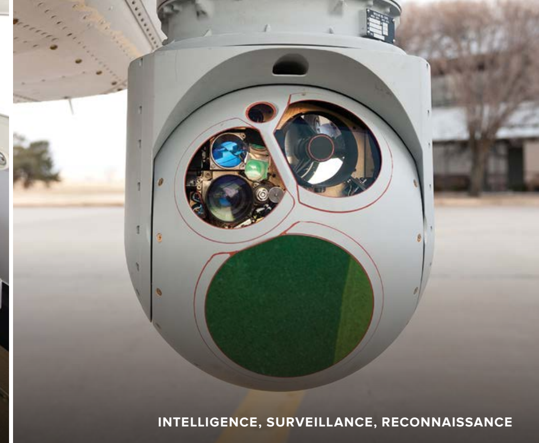
INTELLIGENCE, SURVEILLANCE, RECONNAISSANCE